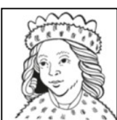
EDWARD V 1483

Edward IV's second reign was successful, the country peaceful, there were no foreign threats and there was a royal nursery full of daughters plus, more importantly, an heir and a spare. No-one expected what happened in 1483. When King Edward died young and suddenly in April everyone assumed his 12 year-old son, also called Edward, would be crowned. Instead, in three dramatic and puzzling months, the young king's uncle, Richard, Duke of Gloucester executed friends and then deposed his nephew on the grounds that the boy and his siblings were illegitimate. This story was either truthful or very convenient but probably not both! Edward V and his brother disappeared and Richard III's reign never recovered from the belief that they'd been murdered. Why Richard took the crown is just as puzzling as the fate of the Princes.