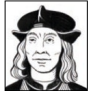
HENRY VII 1485-1509