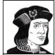
RICHARD III 1483-1485

By late summer 1483 a rebellion was underway, motivated by outrage at Richard's actions. Its leaders, former supporters of Edward IV, wanted at first to put Edward V back on the throne. Then, as rumours spread that young Edward was dead, they chose as their leader the unknown, inexperienced and exiled Henry of Richmond, usually known as Henry Tudor, who had a remote Lancastrian claim to the crown. This desperate choice indicates the depth of their hostility to Richard. The 1483 rebellion failed but many rebels fled to Brittany. The threat of invasion hung over the next two years until, with French help, Henry Tudor and his allies landed in Wales in August 1485 and killed Richard at the battle of Bosworth. The intense, devout Richard had many of the qualities of a successful king but never recovered from the violence he used in deposing his nephew, actions which split the nobles and gentry so that there were at least as many Yorkists fighting against him as for him at Bosworth.