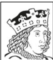
EDWARD IV 1471-1483

France and Burgundy played critical roles in these events. They were acting in their own interests, hoping to win English support, not acting out of loyalty to Henry or Edward.