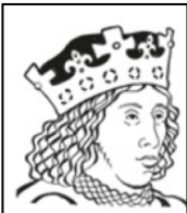
EDWARD IV 1461-1470