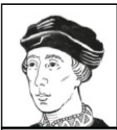
HENRY VI 1470-1471

Edward's closest ally was Richard Neville, earl of Warwick, his wealthy older cousin. For several years the two men worked together but gradually their alliance unravelled. Was Warwick too ambitious or was he angered by Edward's marriage to Elizabeth Woodville or by his choice of foreign policy or by his refusal to let Warwick's daughters marry into the royal family? Whatever the explanation, by 1469 Warwick feared Edward was in danger of being deposed by the Lancastrian remnant in alliance with France. That was why Warwick took the huge gamble of rebelling and, having failed, allied with his old enemy Queen Margaret, one of the most bizarre alliances in English history. Briefly it worked. Edward was forced to flee abroad and Henry, hapless Henry, was king again. Then Edward returned with Burgundian support and in a clever, devious, ruthless military campaign fought and killed Warwick at the battle of Barnet in April 1471 and next month beat the Lancastrians at Tewkesbury where Henry's heir, 17 year-old Prince Edward, was killed. Henry VI was then murdered in the Tower of London. The Lancastrian cause was dead.